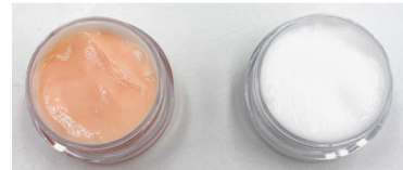
Without Lipo-QUEST BG With 0.5 % Lipo-QUEST BG

Basic emulsion intentionally polluted with ferric chloride