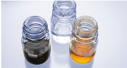
CHEMICALS AND PETROLEUM PRODUCTS

Depending on the viscosity of your sample, you may either choose the L-model for low-viscosity samples, R-model for medium-viscosity (regular) samples, or H-model for high-viscosity samples.