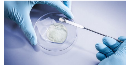
COSMETICS & PHARMACEUTICALS